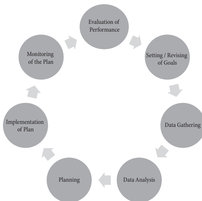
Figure 1: Planning process flow

Planning in public sector is a main tool for articulating public policy. The fundamental aim of development plans until today has always been to ensure that economic growth and social development continue in a sustainable manner. In this respect, increasing competitiveness, rise in employment, human and regional development, strengthening social protection and solidarity, and increasing quality and efficiency of public service have usually been in central attention of all development plans. Hence, depending on the evolution of political economy mainstream, different importance, position and methods were associated with plan and planning across different periods of time and countries. While it was used in centrally-planned socialist economies to allocate all or majority of resources, it is also present and popular in free-market societies. Since the 1980s and rise of neoclassical liberal economic theories, the New Public Management approach has brought along a new order in which the private sector has had a more effective role in economy. Plan has changed scope and methods but remained an important tool in public management. Planning of aggregates and planning based on deterministic, heavy and detailed calculations have lost popularity. These were criticized for ignoring absorptive