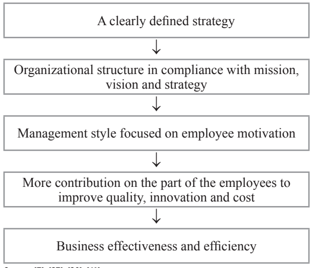
Figure 1: Prerequisites for generating efficient company operations

impact of organizational structure on the performance of companies. Summarized results have shown that companies with clearly defined strategies and organizational structures, as well as a leadership style focused on employee motivation, were more successful and efficient (Figure 1) [7], [27], [30], [41]. An efficient organizational structure has emerged as one of the key competitive advantages and an important factor in a company's market success, especially if it is aligned with the company's mission, its competitive environment and the resources available.